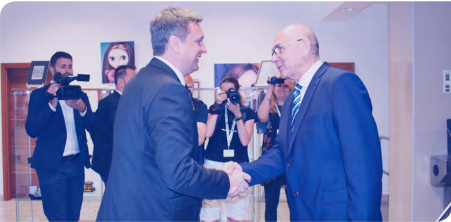
Visit by Andrej Danko, the National Council of the Slovak Republic Chair – May 2018

Bratislava meeting of the INTOSAI global working group targeting the sustainable financing of the public administration and support of public policies in social and pension systems, health and education