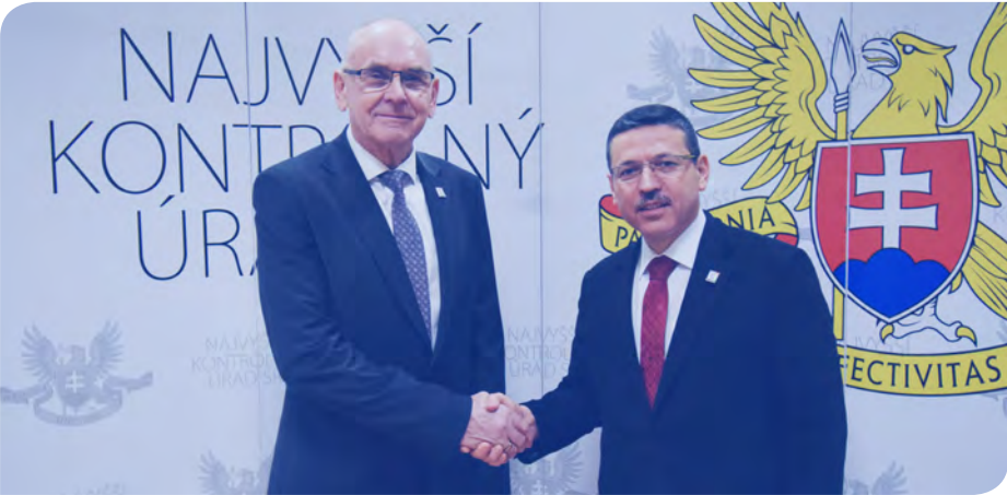
Visit by Seyit Ahmet Baş, the President of EUROSAI and SAI of Turkey – April 2019