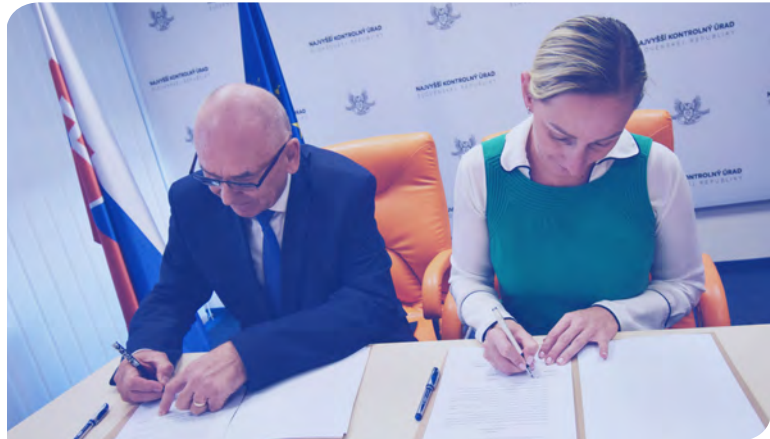
Signing the Memorandum on Cooperation with the Faculty of Social and Economic Science of the Comenius University October 2018