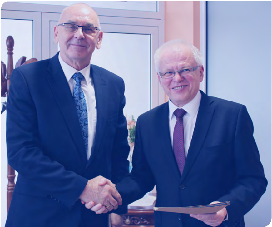
Signing the Memorandum with the University of Economics in Bratislava