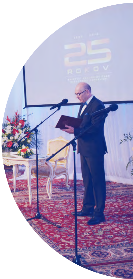
Celebrations of the 25 th anniversary of the SAO SR establishment - April 2018

The Supreme Audit Office of the Slovak Republic is an independent state body that audits the management of the funds and property of the state, local authorities and the European Union. Its status and scope is stipulated by articles 60-63 of the Constitution and Act no. 39/1993 Coll., on the Supreme Audit Office of the Slovak Republic. Its audit activities are carried out under resolution of the National Council and according to its own schedule of audit activities. Similar audit institutions operate in almost all countries in the world, yet even within the European Union itself, there is no single model.