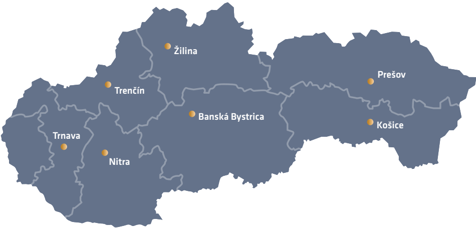
Výsledky kontroly samosprávy