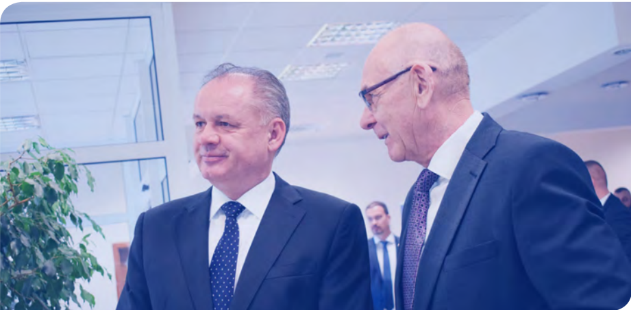
Visit by Andrej Kiska, the Slovak Republic President – March 2018