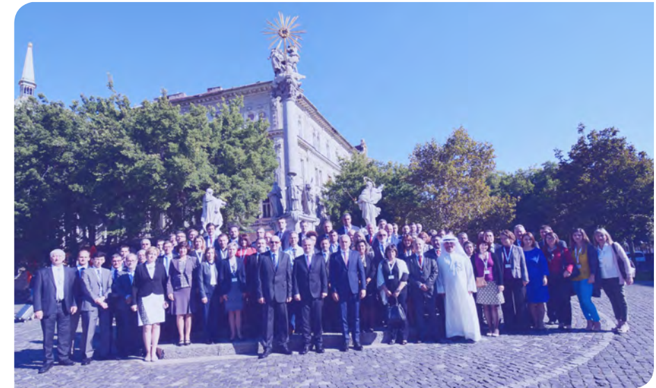
Working group for environmental audits - September 2018