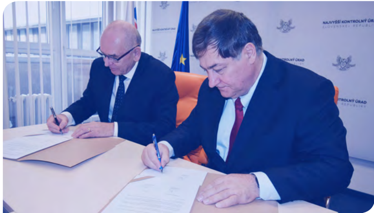
Signing the Memorandum on Cooperation with the Centre for Science and Technical Information December 2018

It is one of the ways to combine forces to multiple views into one goal, to offer recommendations to auditees that can not only take effective action, but also model systemic changes for support public policy sustainability and economy in public finance management.