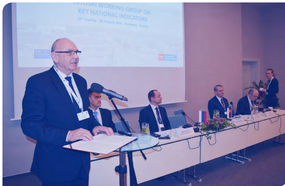
Working group for national indicators – April 2019

International activities and know-how exchange at an international level contribute to the development of methodologies and the quality of work and thus towards improved implementation of the Slovak SAO's mandate for the benefit of citizens and the society.