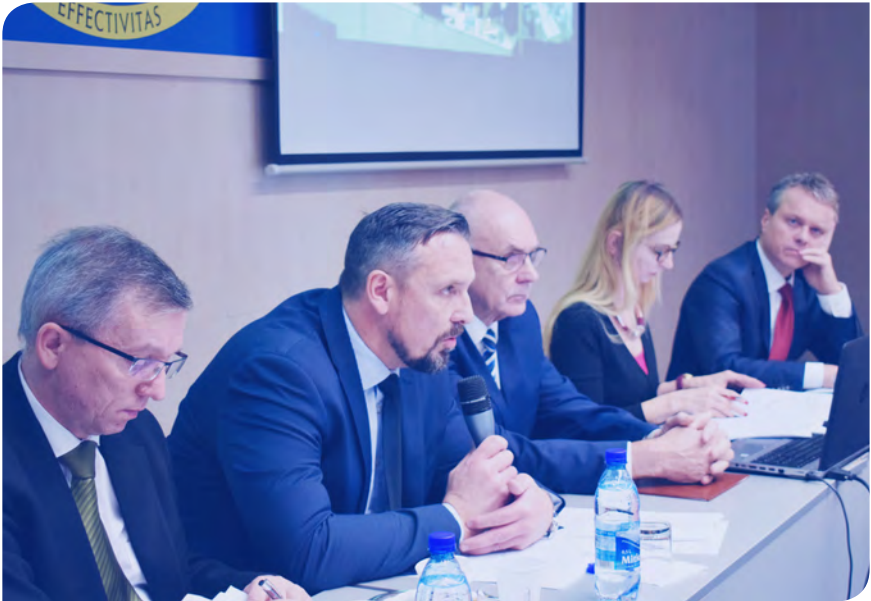
Assessing the Memorandum on Cooperation with the Attorney General and the Ministry of Interior of the Slovak Republic